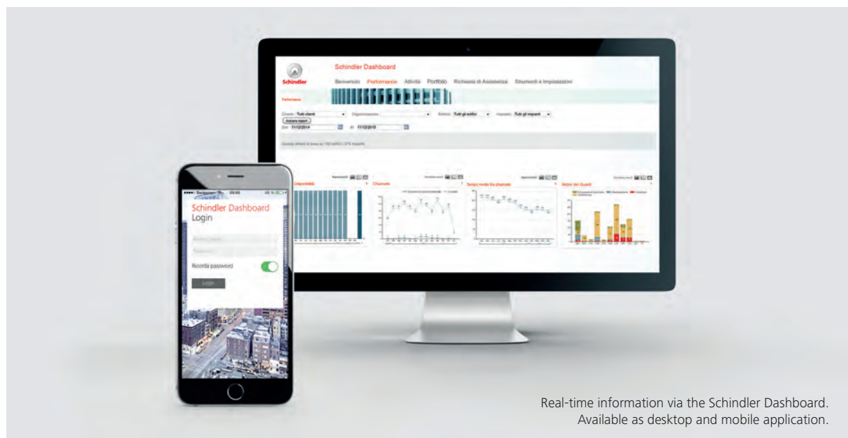
Real-time information via the Schindler Dashboard. Available as desktop and mobile application.

Up-to-date instant information about performance and service status